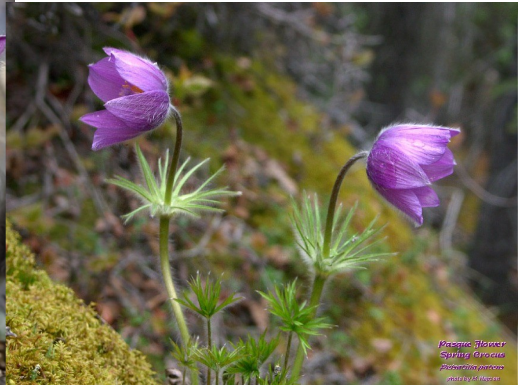
Pasque Flower Spring Crocus Pulsatilla patens