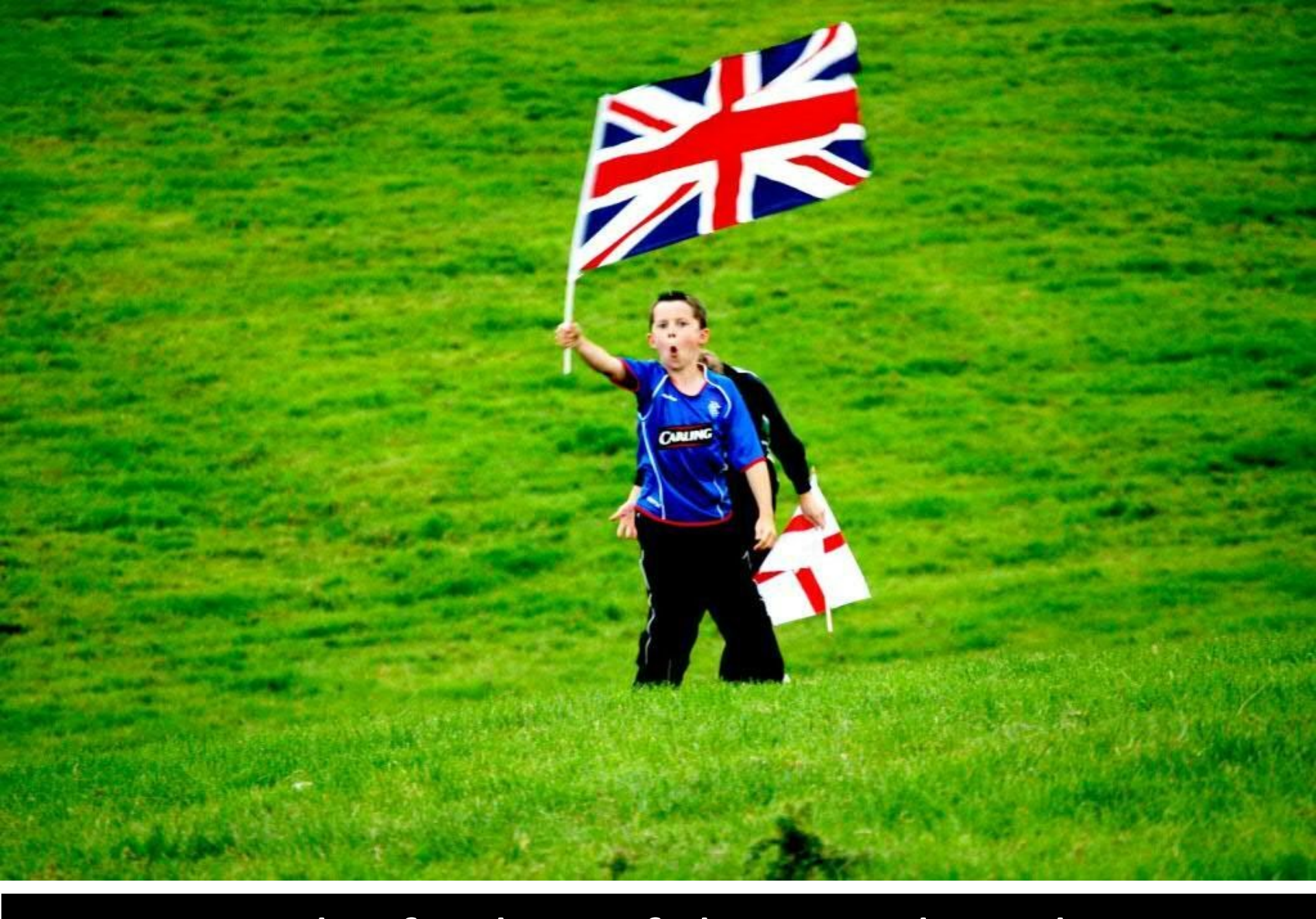
Write the fist line of the British anthem.