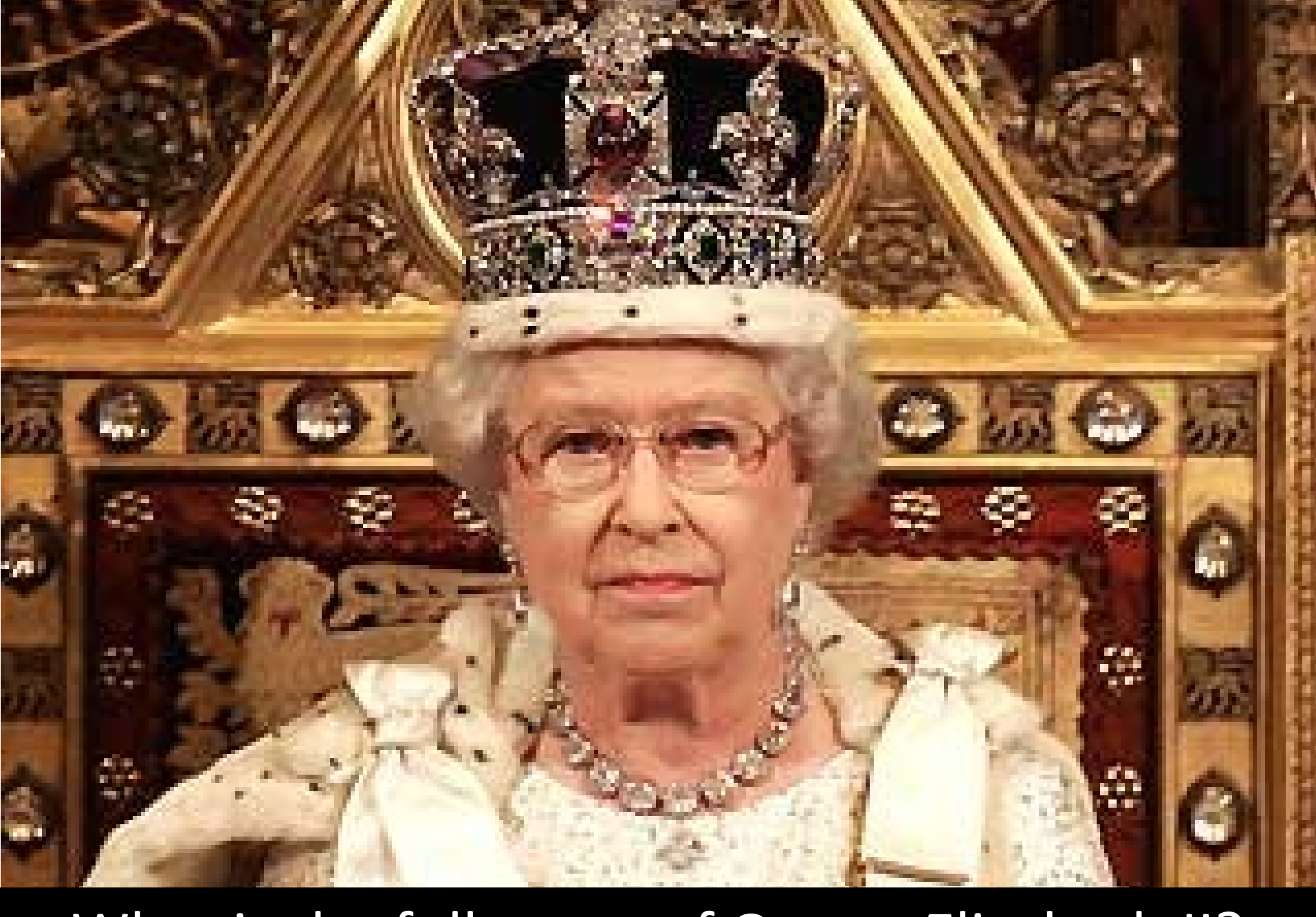
What is the full name of Queen Elizabeth II?