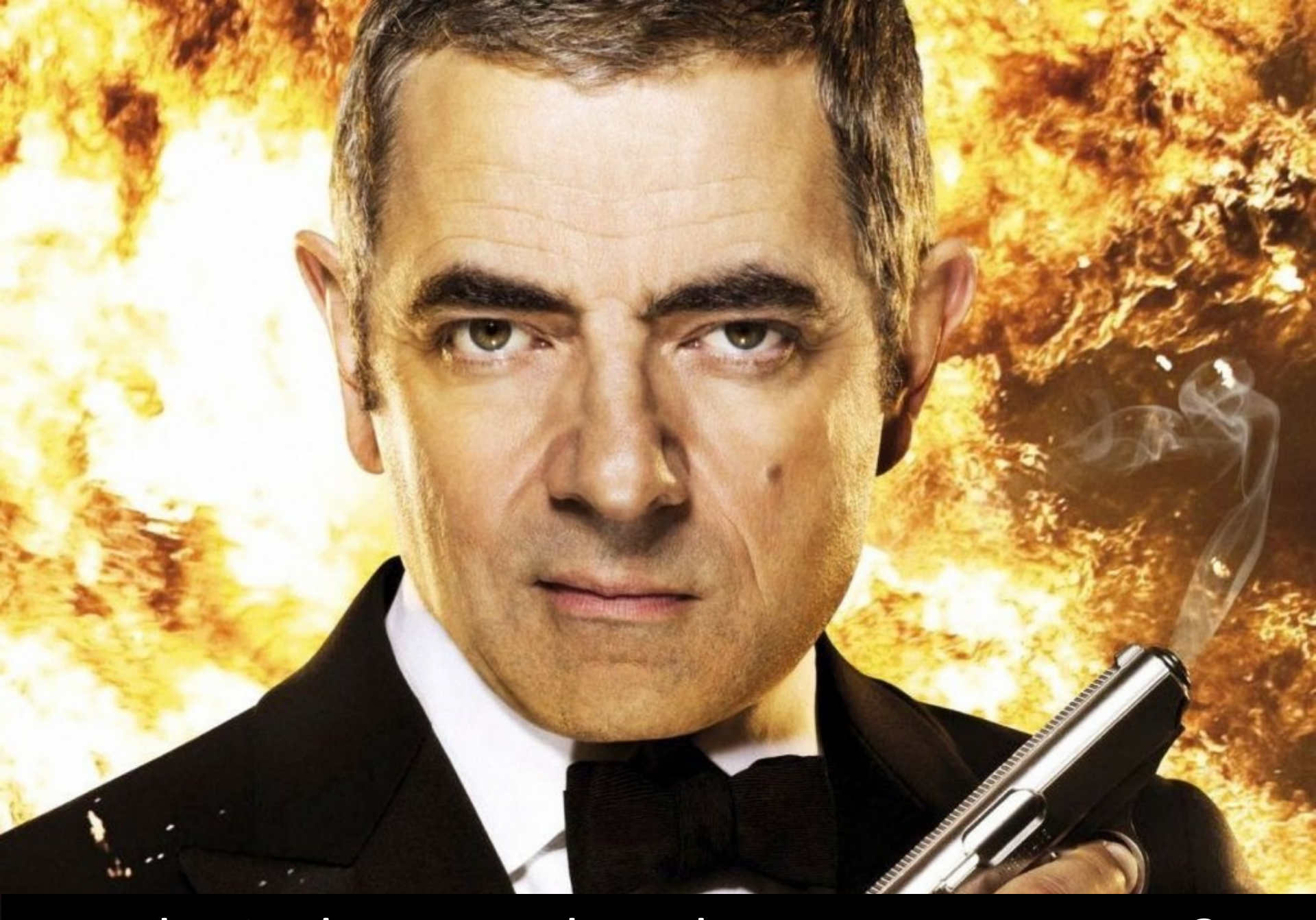
Who is the actor, best known as Mr Bean?