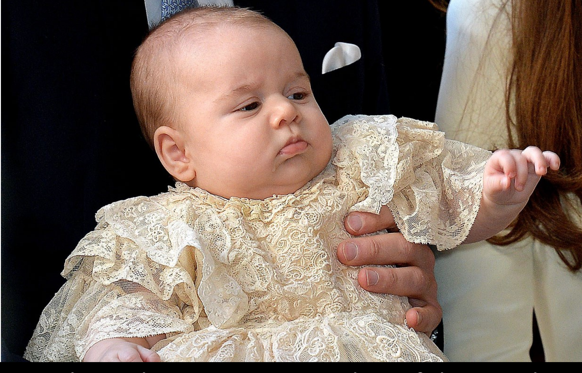
Who is the youngest member of the Royal family?