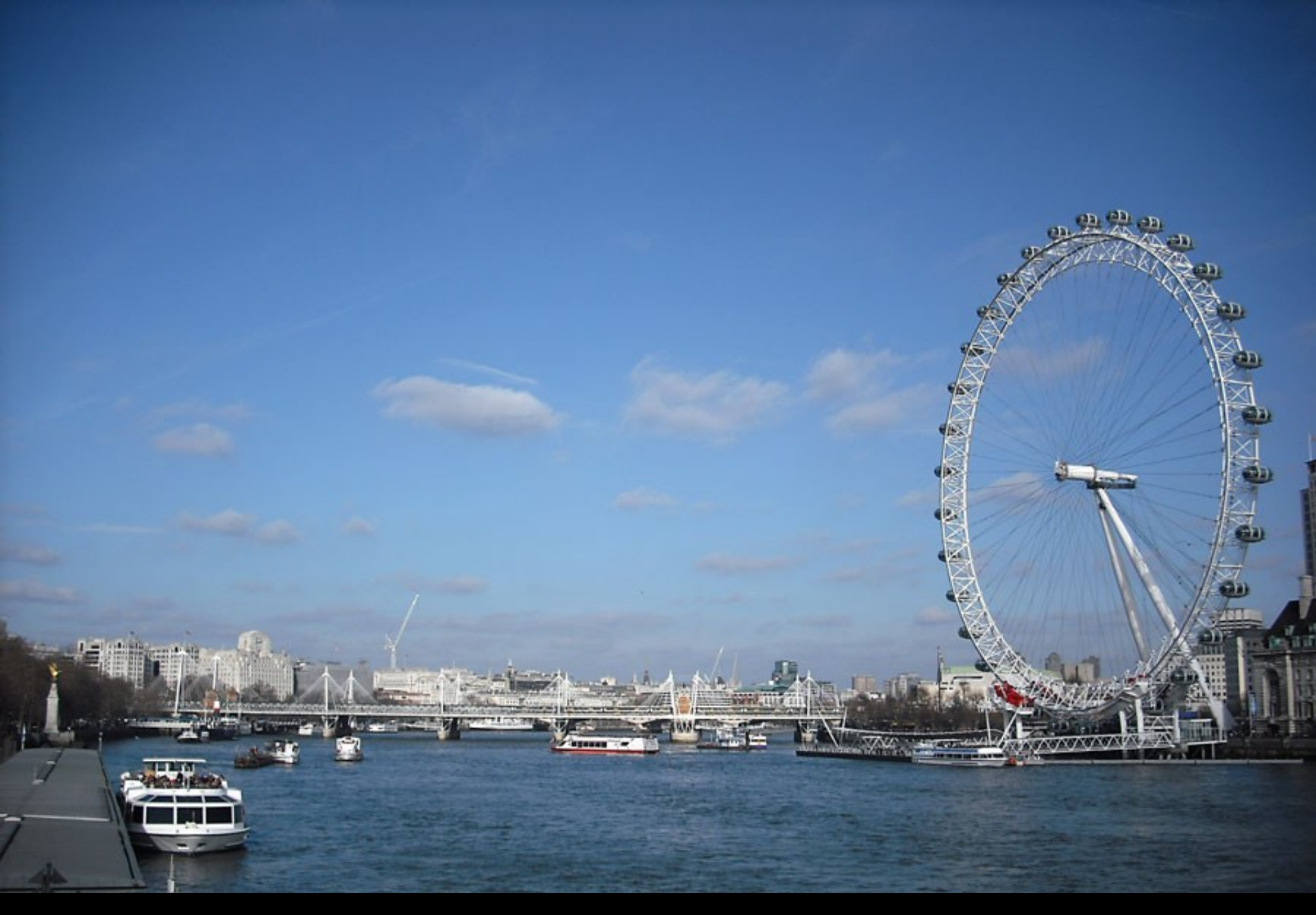
Which river flows through London?