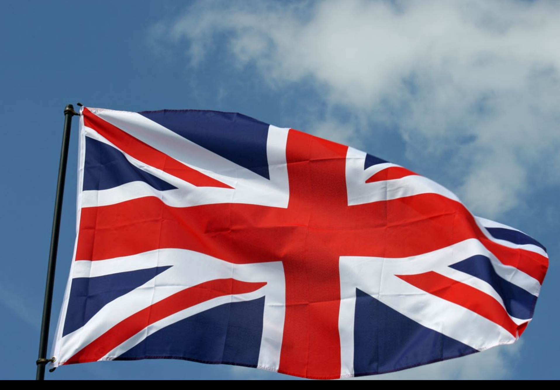
How is the flag of the UK called?