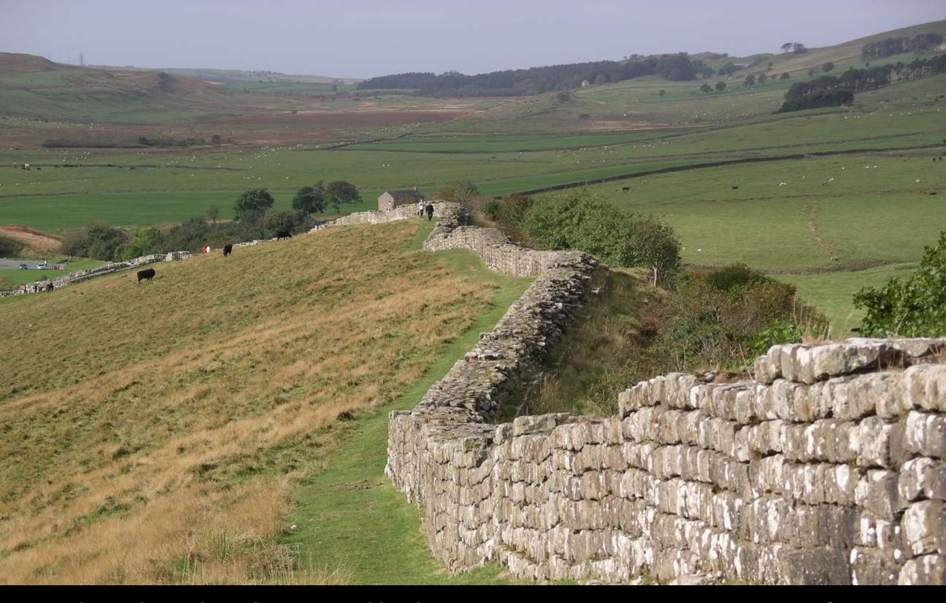
Who built the wall that separates Britain from Scotland?